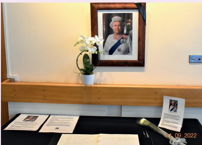
A book of condolence was opened at The Radlett Centre on Friday 9 September