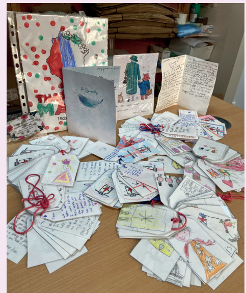
Children left beautiful tributes, including pupils from Newberries School who all made tags with heartfelt messages and pictures of The Queen